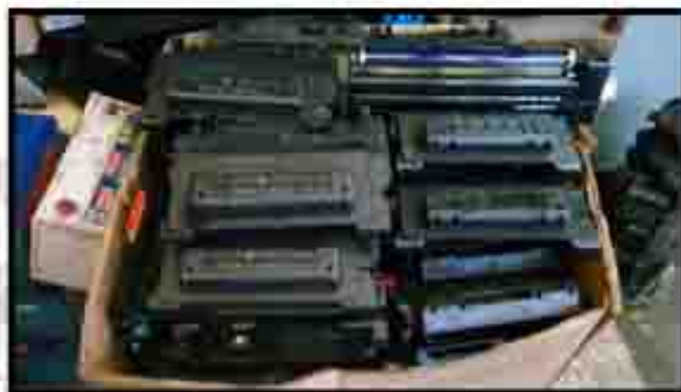
Plastic Toners, Inks, and Cartridges