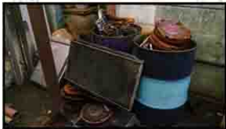
Vehicle Spare Parts