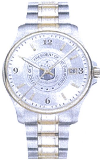
39mm Male *