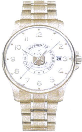
39mm Male *